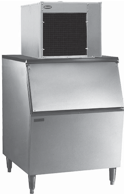
Model MFD400ABT flake icemaker (shown on Follett 425-30 ice storage bin, ordered separately)

Follett's modular flake icemakers offer the right ice for a broad range of healthcare and foodservice applications as well as exceptional reliability for long equipment life. Both air- and water-cooled models use environmentally-friendly R404A refrigerant and produce approximately 400 lbs/day (181kg) of soft, moldable flake ice.