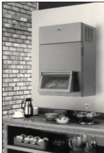
Wall mount kit included