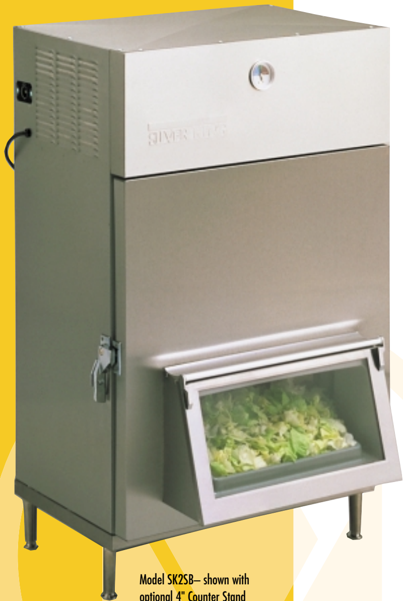
Model SK2SB— shown with optional 4" Counter Stand