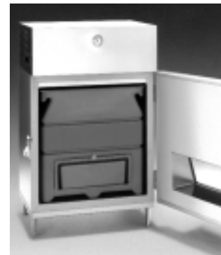
Removable bin holds 50 heads of lettuce. Additional bins available for auxiliary storage.