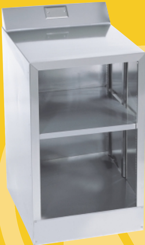
Dry storage cabinet